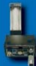
MDT-McKesson Analog Four