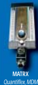
MATRIX Quantiflex, MDM

Flowmeters should be calibrated and have maintenance service every 2 years. There are literally thousands of flowmeters in dental operatories that have not been checked in over a decade. Many of the manufacturers of many of these units are now out of business. Porter Instrument Company offers fast turn-around service on the following flowmeters: Porter Standard Serial No. 14000-25000; Porter MXR Serial No. 50000-80000.