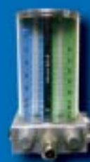
HAMPTON Simplaire Micro