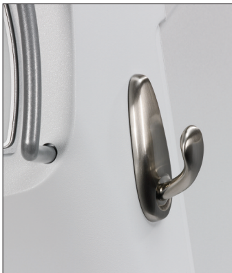
A side hook conveniently holds the breathing circuit and hoses.