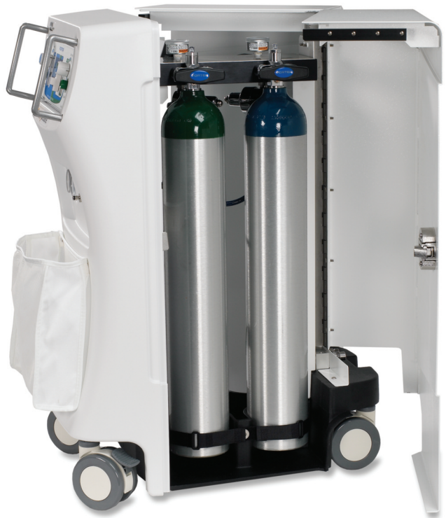
Sentry Sedate holds two nitrous oxide cylinders and two oxygen cylinders.