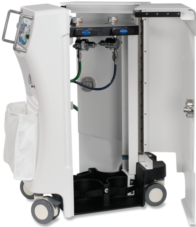
The sturdy cabinet design features both internal and external storage.