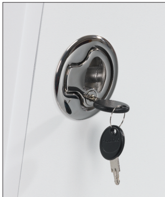
The dual locks ensure safe, secure cylinder storage.