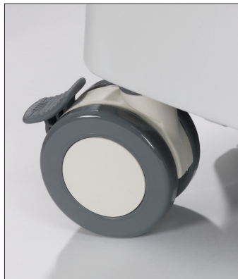
Large locking wheels allow the unit to be easily moved from room to room.