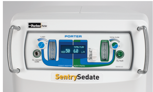
Porter MXR-D Digital and Analog Flowmeter