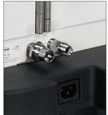
Oxygen and nitrous oxide quick connect ports bypass cylinders when wall gas is available.

For more information, contact Praxair - Authorized Porter Distributor: