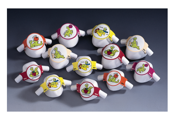
DYNOMITE 24-PACK BAG