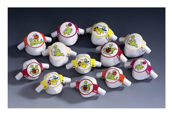
DYNOMITE 12-PACK BAG