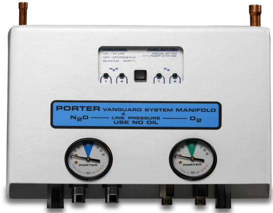
Porter Vanguard Manifold

Product Application: Manifold Gas System for Nitrous Oxide and Oxygen for Level II facility.