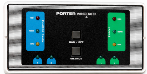
Porter Vanguard Wall Alarm Panel